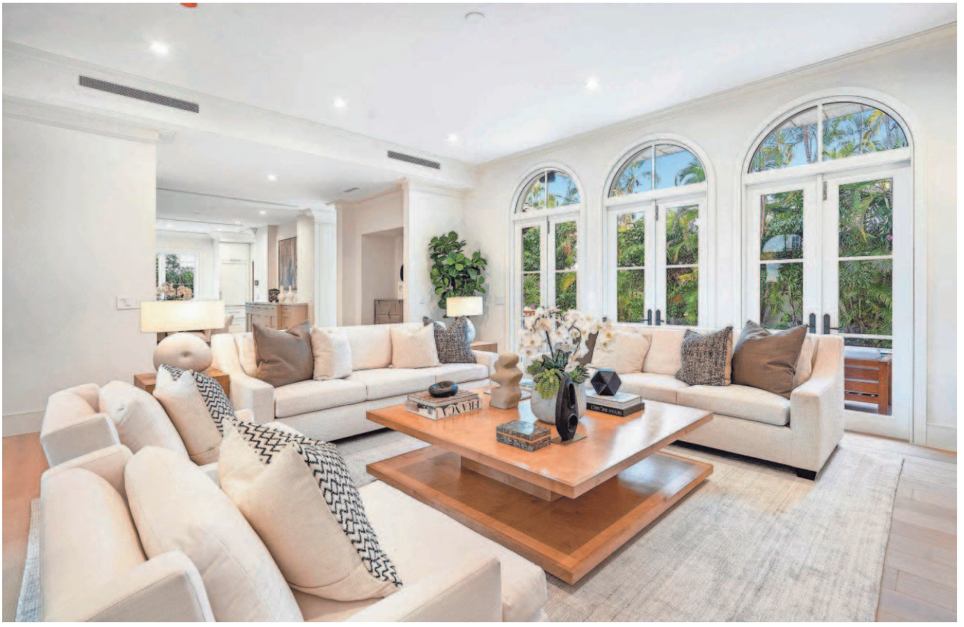
A bank of French doors with fanlights brings natural light into the living room while offering access to the pool area. The renovated house at 230 Atlantic Ave. in Palm Beach is listed at $14.75 million.