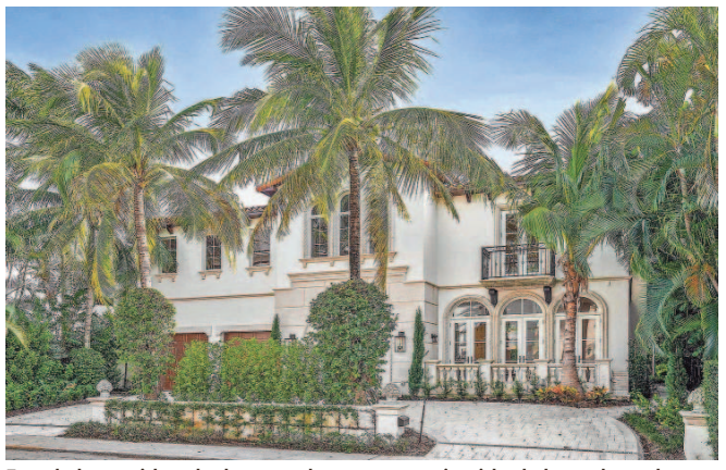
French doors with arched surrounds open to a patio with a balustrade on the front of the Mediterranean-style house at 230 Atlantic Ave.