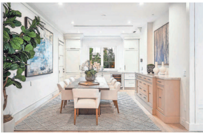
The dining room features a new wet bar with wine storage at the far end.