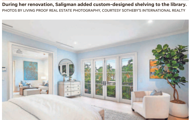
When the house was updated, Saligman replaced many of the floors with white-oak planks, including the ones in the main bedroom suite.