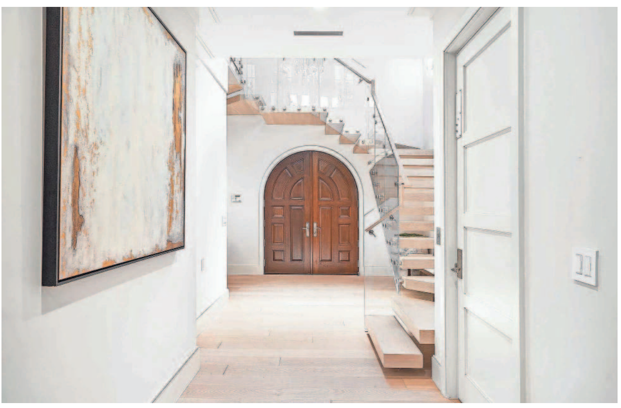
To help lighten the foyer and give it a more modern feel, Saligman added a "floating" staircase with glass panels to the stair hall.