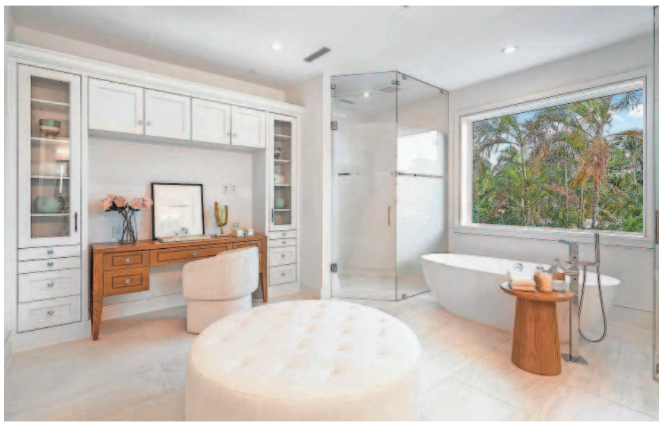
The main bedroom's bathroom has a freestanding soaking tub and a glassed-in shower.