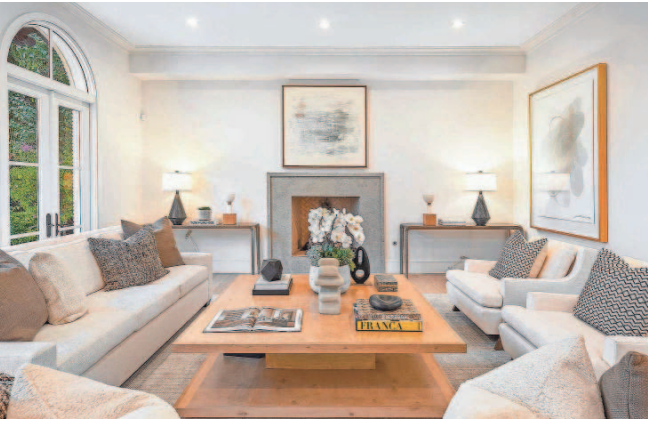
Interior designer and homeowner Linda Saligman updated the living room's gas fireplace with a simple geometric surround fashioned from marble.