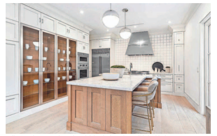
Saligman chose a T-shaped work island when she redid the kitchen at 230 Atlantic Ave. in Palm Beach.