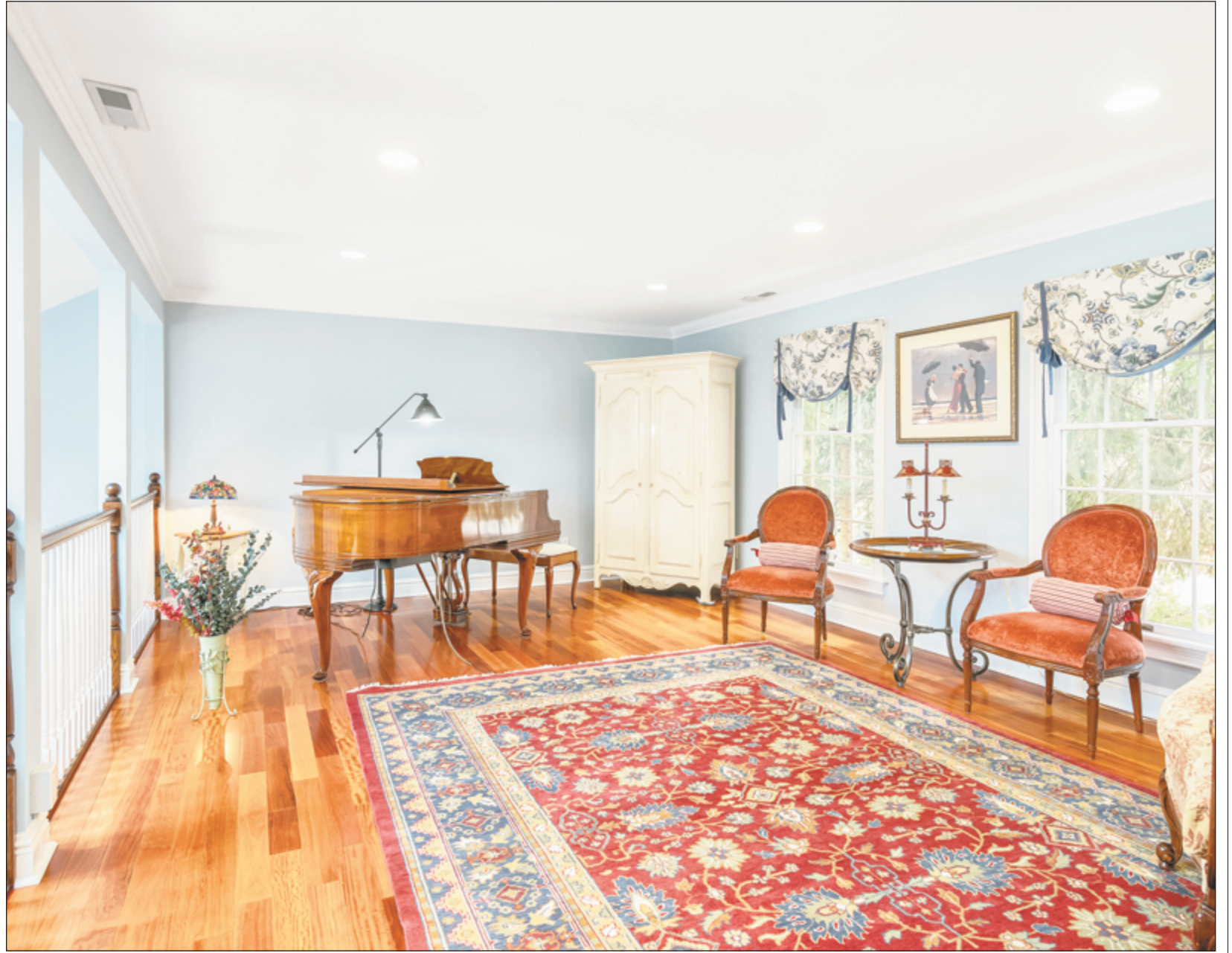
One of the well-appointed seven rooms at 99 Loughlin Ave., Cos Cob.

Transitional Cos Cob house in convenient location