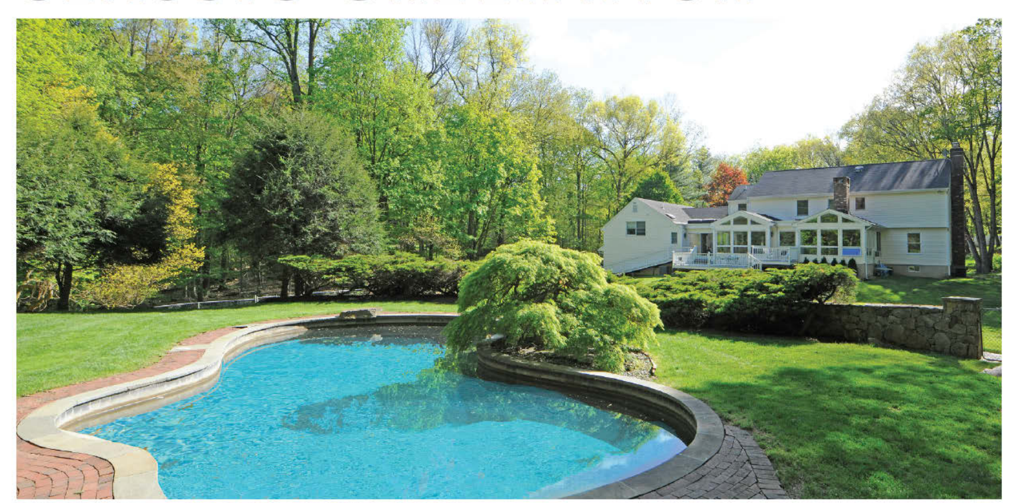
NEW PRICE | Greenwich | $1,895,000 | Web# CT106591

First time on the market in 38 years. This 5-BR, 6.5-BA classic Center Hall Colonial is nicely sited on approx. 4 acres on a quiet cul-de-sac. Beautifully manicured property with stone walls and an oversized pool. Other highlights include an elegant foyer, a well appointed kitchen with vaulted eat-in area that overlooks the expansive grounds, a cozy den, office, family room, solarium, a master bedroom suite with 2 walk-in closets and luxurious bath with separate shower. Offers a 3-car attached garage, with full basement ready to be finished.