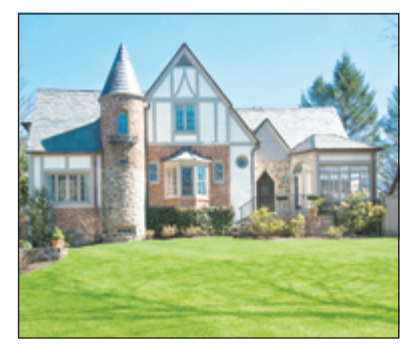
WHAT TO BUY