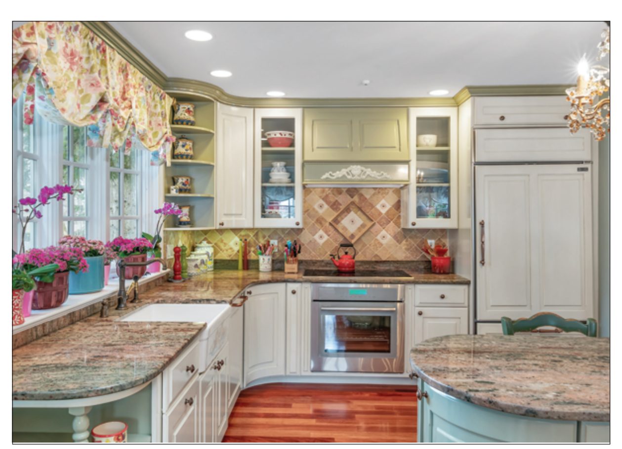
99 Loughlin Avenue, in the Loughlin Park neighborhood of Cos Cob, is listed for $1.169 million by Sotheby's International Realty. The three-bedroom house has 2,264 square feet of living space, with interiors that strike a balance between traditional and contemporary.

One of the seller's favorite features of the house is the hardwood flooring throughout — "in perfect