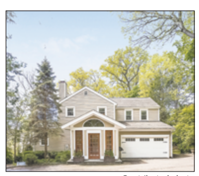
WHAT TO BUY