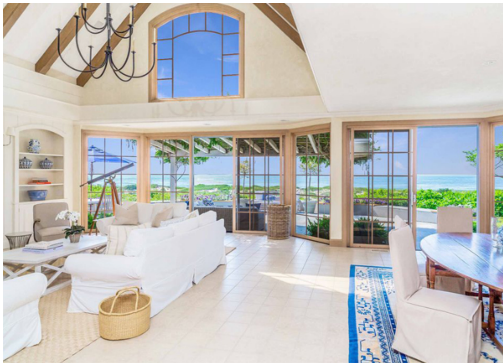
32 Windmill Lane in East Hampton