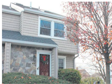
5 Glen Street #206 $670,000