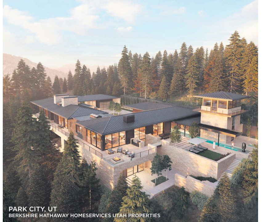
PARK CITY, UT BERKSHIRE HATHAWAY HOMESERVICES UTAH PROPERTIES