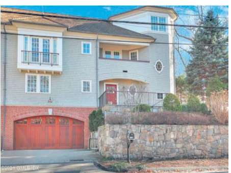
77 Indian Harbor Drive Under Contract