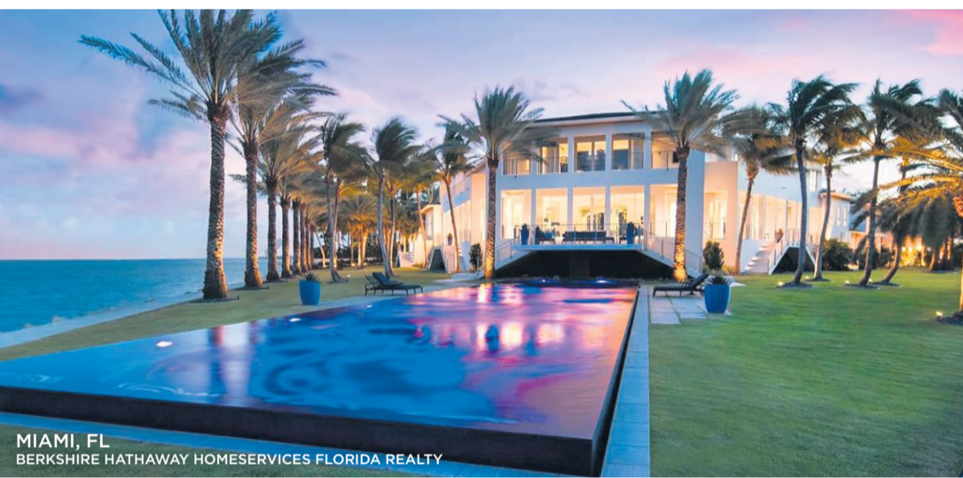
MIAMI, FL BERKSHIRE HATHAWAY HOMESERVICES FLORIDA REALTY