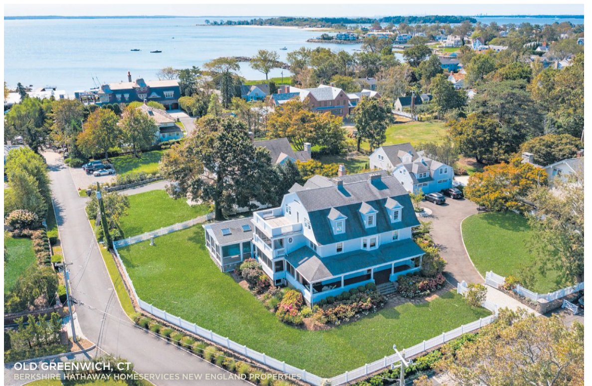
OLD GREENWICH, CT BERKSHIRE HATHAWAY HOMESERVICES NEW ENGLAND PROPERTIES

Backed by the number one real estate company, Berkshire Hathaway HomeServices agents have the brand exposure and global relationships to reach buyers of distinction from New York to Dubai, and everywhere in between.