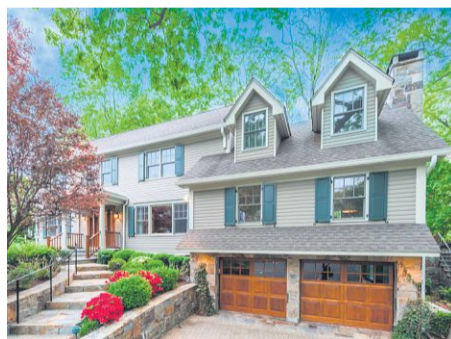
6 Sheldrake Road $2,211,000