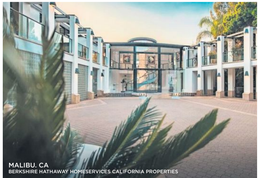
MALIBU, CA BERKSHIRE HATHAWAY HOMESERVICES CALIFORNIA PROPERTIES