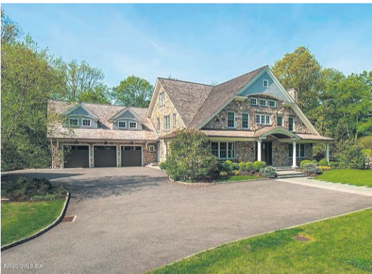
28 Quail Road $6,550,000