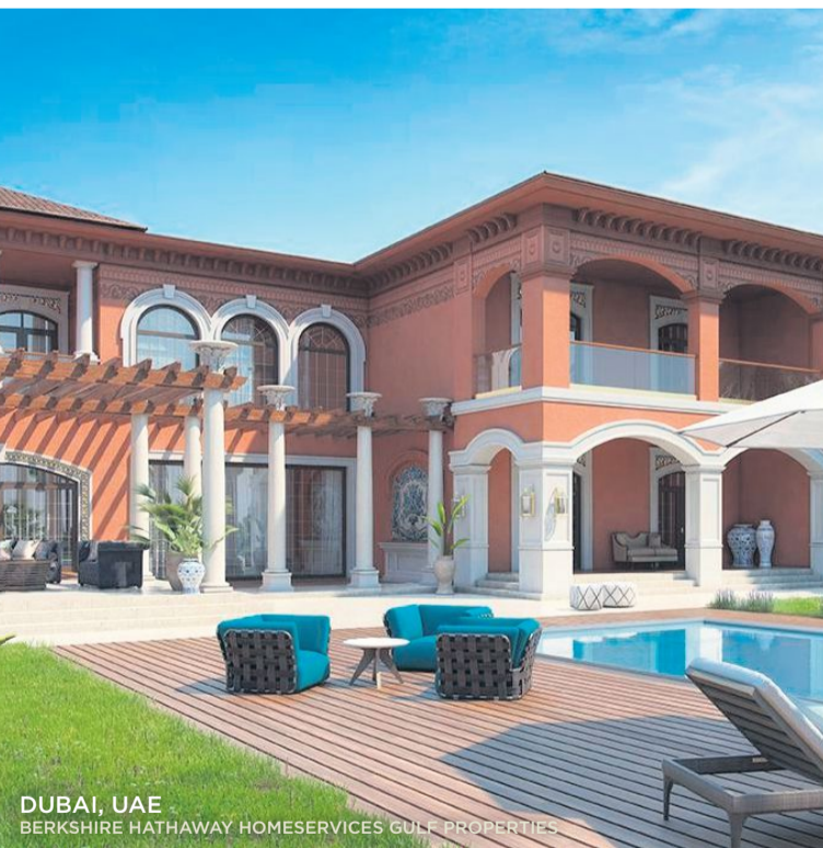
DUBAI, UAE BERKSHIRE HATHAWAY HOMESERVICES GULF PROPERTIES