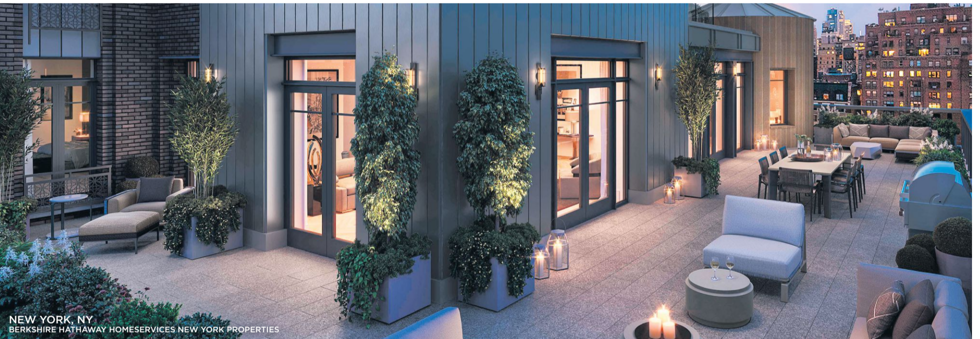
NEW YORK, NY BERKSHIRE HATHAWAY HOMESERVICES NEW YORK PROPERTIES