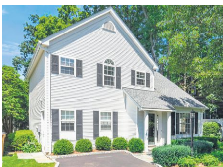
115 Top Gallant Road #2 Under Contract

THREE DECADES BUILDING A GREAT TEAM OF LAWYERS, INSPECTORS AND LENDERS TO SMOOTH THE TOUGHEST TRANSACTION! And... Introducing Jillian Hofer—a talented new addition to my team to make things even smoother!