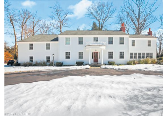
95 Indian Head Road $3,350,000