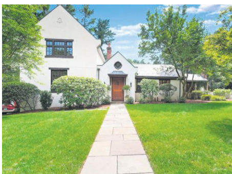
120 Dingtowntown Road $2,325,000