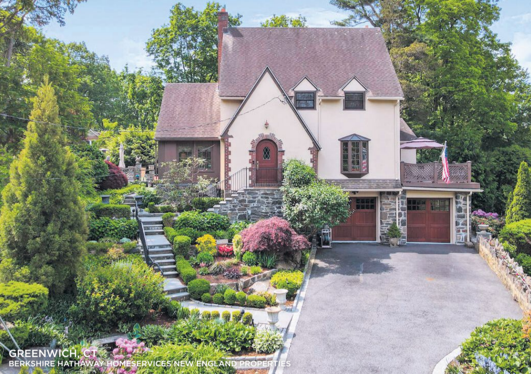
GREENWICH, CT BERKSHIRE HATHAWAY HOMESERVICES NEW ENGLAND PROPERTIES