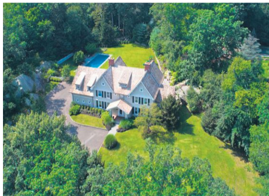
434 Cognewaugh Road $3,460,000