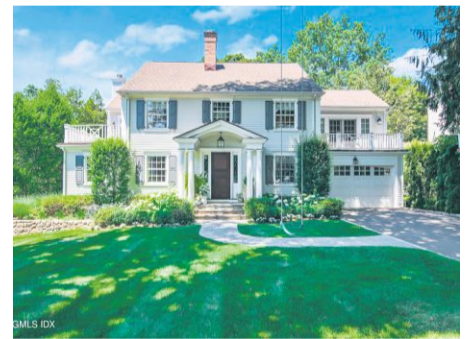
145 Lockwood Road Pending