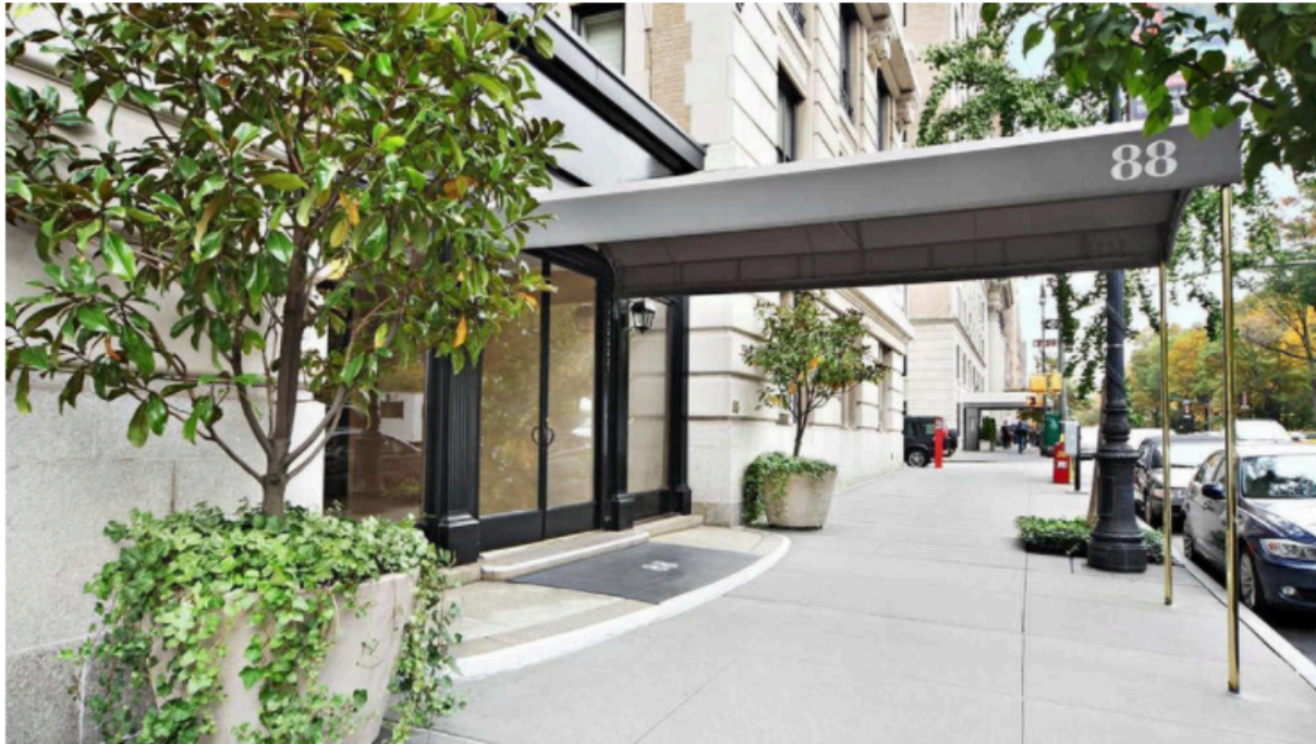
Sold, Jul 11, 2017; Douglas Elliman