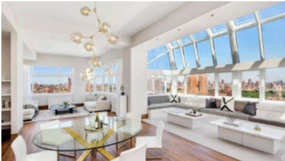
Dining & Living Area