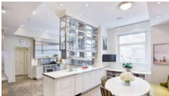
Kitchen