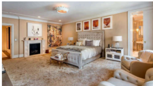
Bedroom