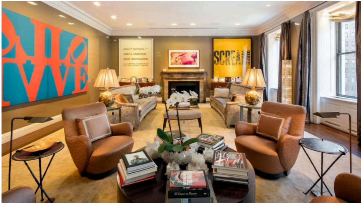
Sold, Jul 13, 2017; Douglas Elliman