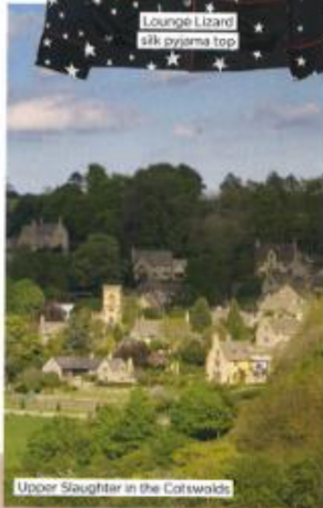
Upper Slaughter in the Cotswolds