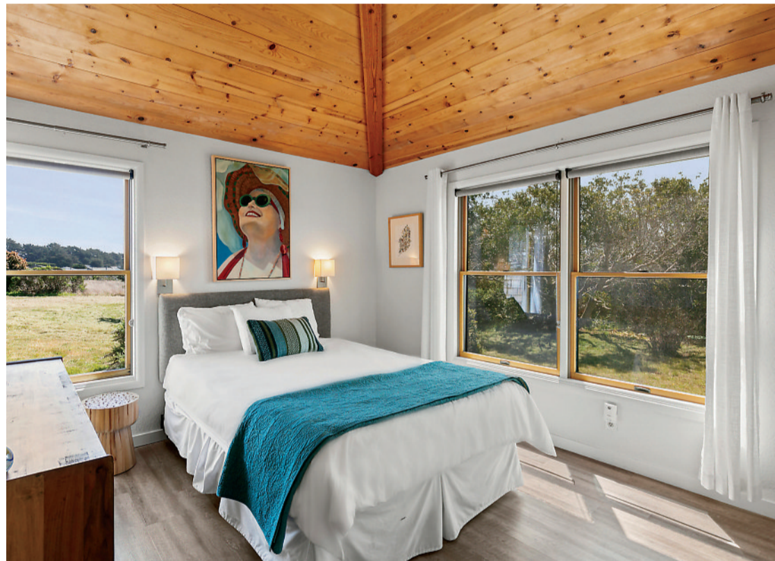
Above: This bedroom enjoys views of the serene setting. Below: The loft enjoys plush carpeting, window seats and views of the water.