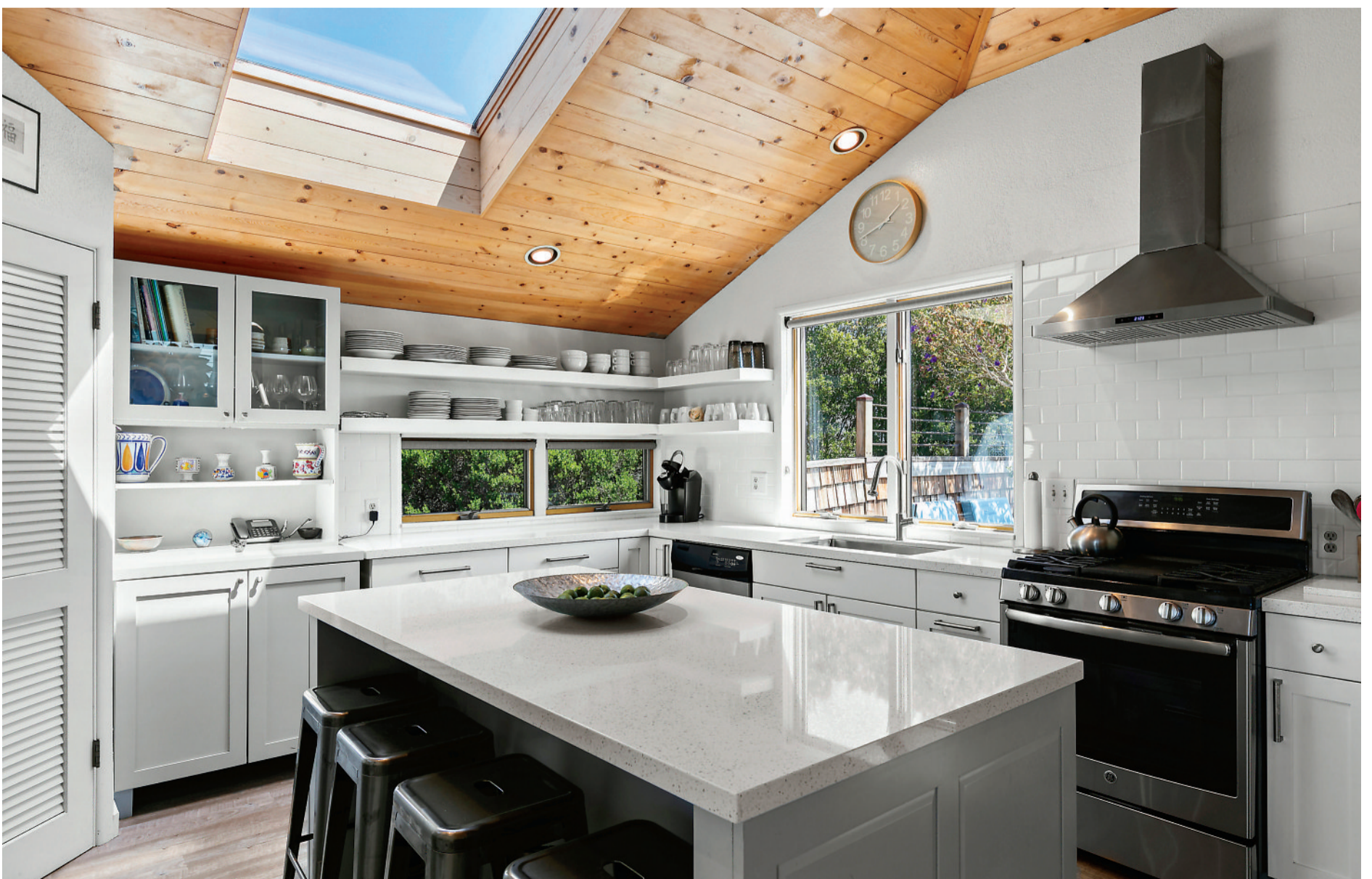
The kitchen includes a dining island and display shelving.

Listing agent: Kathleen Ball, Sotheby's International Realty, 707-322-8112, kathleen@kathleenball.com.