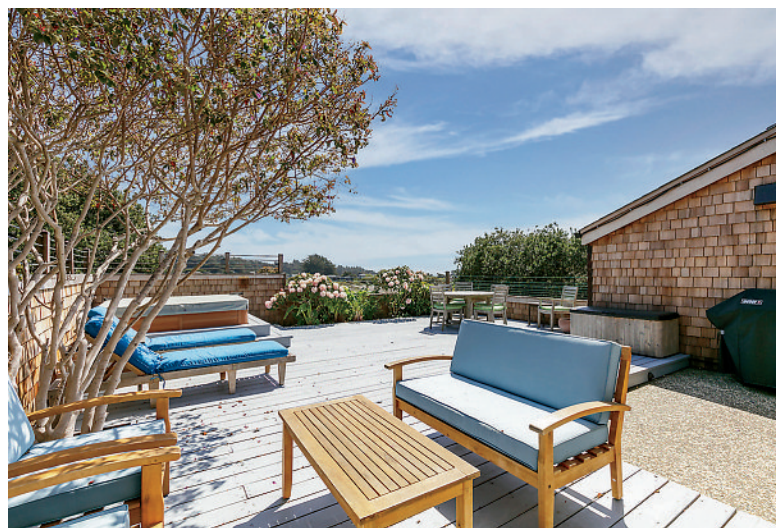
The deck includes a hot tub and lounge areas.