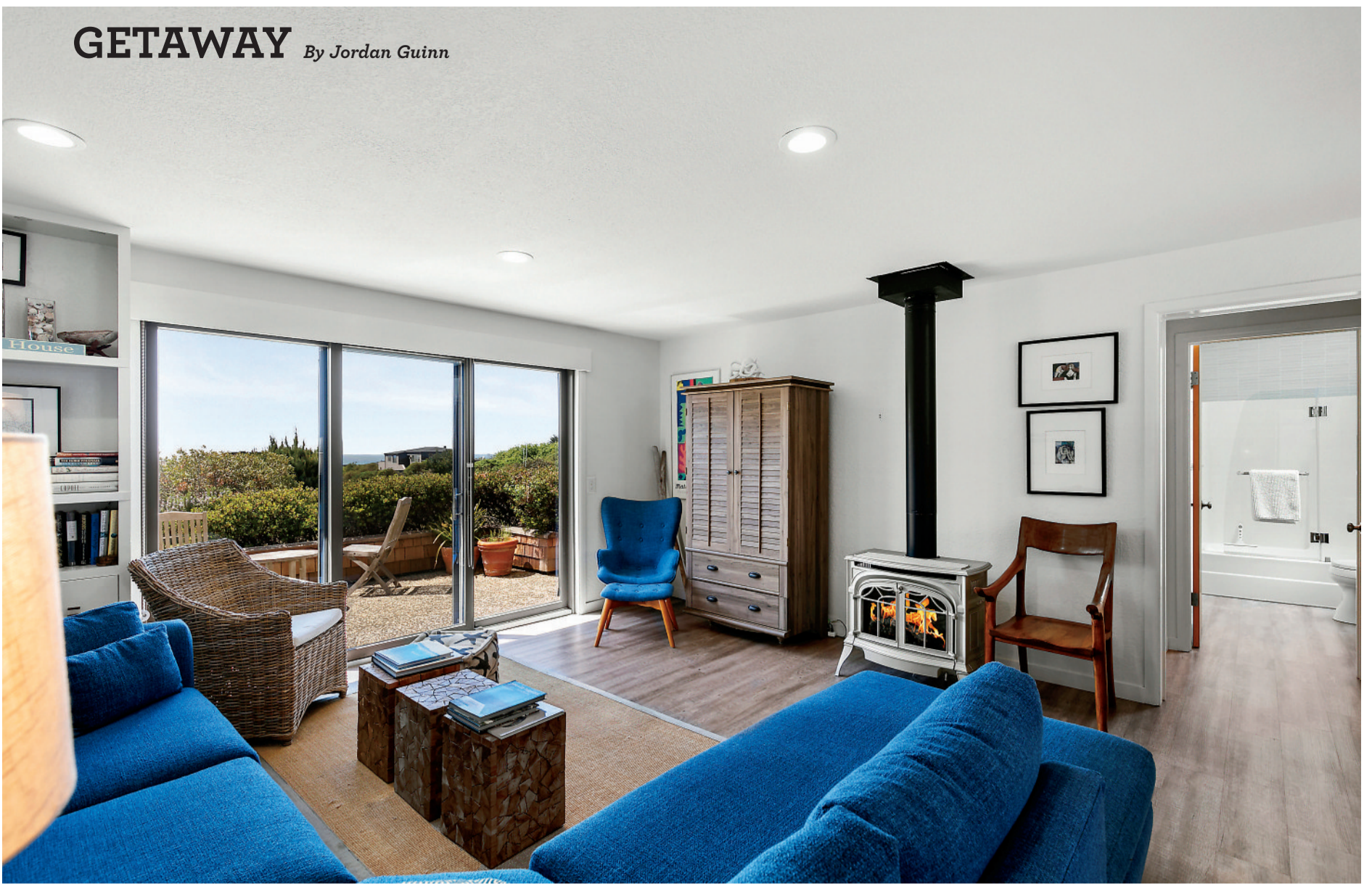
BILL OXFORD / OXFORD PHOTOGRAPHY & GRAPHIC DESIGN