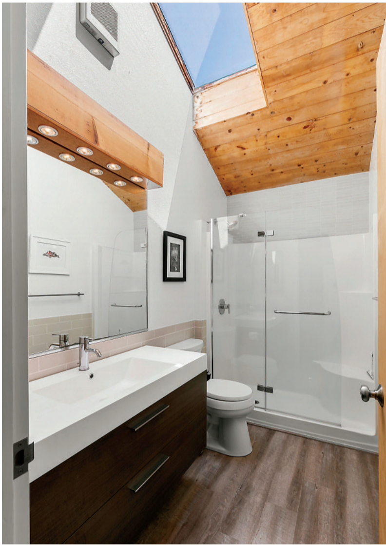
A skylight illuminates this contemporary bathroom.