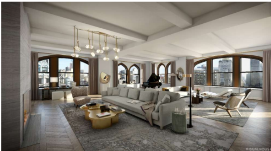
212 Fifth Avenue penthouse interiors

212 Fifth Avenue got its start as a neo-Gothic office building designed by Schwartz & Gross in 1913. More than 100 years later, Madison Equities helmed a conversion of this historic Beaux Arts building to condominiums. A redesign by Helpern Architects kept many of the historic details intact while creating sumptuous residences within. The only penthouse, known as The Crown, has just gone on the market for $73.8 million .