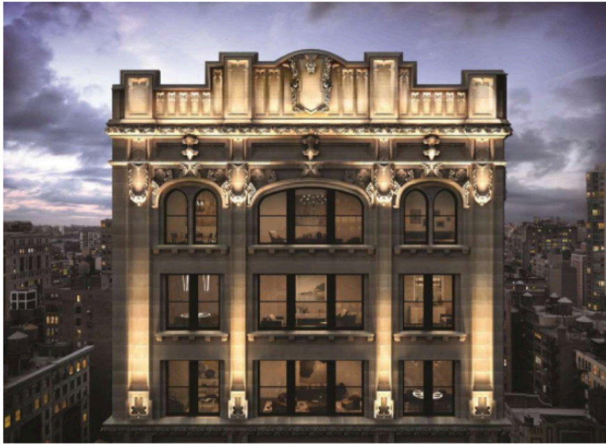
212 Fifth Avenue via Madison Equities